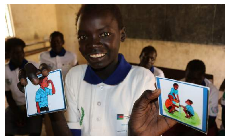
The Water for Eastern Equatoria project in South Sudan provided training on hygiene to 135,000 beneficiaries

out the most vulnerable households. The project is also involved in setting up sanitary facilities for hand-washing, raising awareness on how to reduce exposure – such as the use of facemasks in public places – establishing protective practices for elderly and sick people, and arranging for quarantine measures including delivery of water, food and removal of waste. Small enterprises are being trained to produce hand-washing facilities (tippy-taps, jerry-cans with a tap), soap, faceguards, and possibly chlorine, all of which can be ordered and transported to schools, market places, churches, mosques etc.