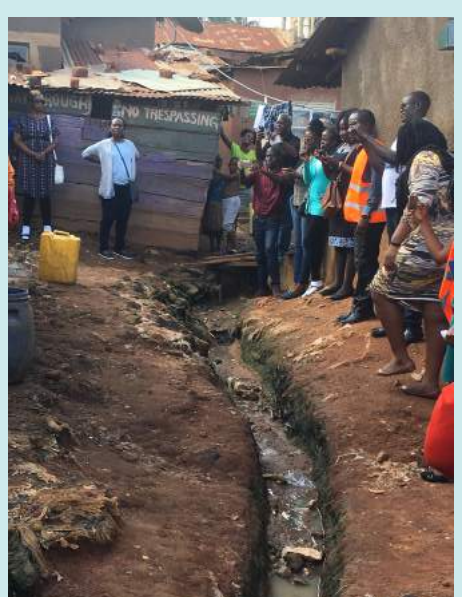
How to provide sanitation services in challenging environments is one of the areas addressed within the SUWAS ITP. Photo @Jenny Fredby, Kampala 2019.

At the core of the training programme lies the critical aim of improving water and sanitation services for the most marginalised groups in communities, the ones not yet accessing safe and adequate services today. The spread of the COVID-19 virus and its consequences