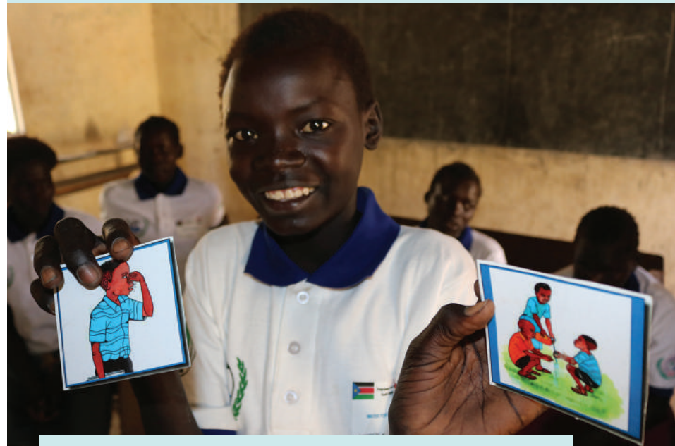
The CHST approach is based on the premise that hygiene practices are largely acquired during childhood, and it is much easier to change children's habits than those of adults.